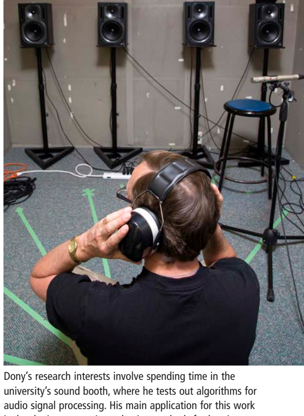
is developing new noise reduction methods for hearing aids, among other applications.

cation and career, I've always been drawn to projects that have a positive impact on society, and I think that seeing my dad's career influenced those decisions. His views on the future of engineering, especially in an academic sense, and its need to adapt to our new problems I'm sure has had a huge impact on our career paths. He has continuously emphasized making things better, learning new skills, and making data-driven decisions, even if that meant disrupting the way things have always been done."