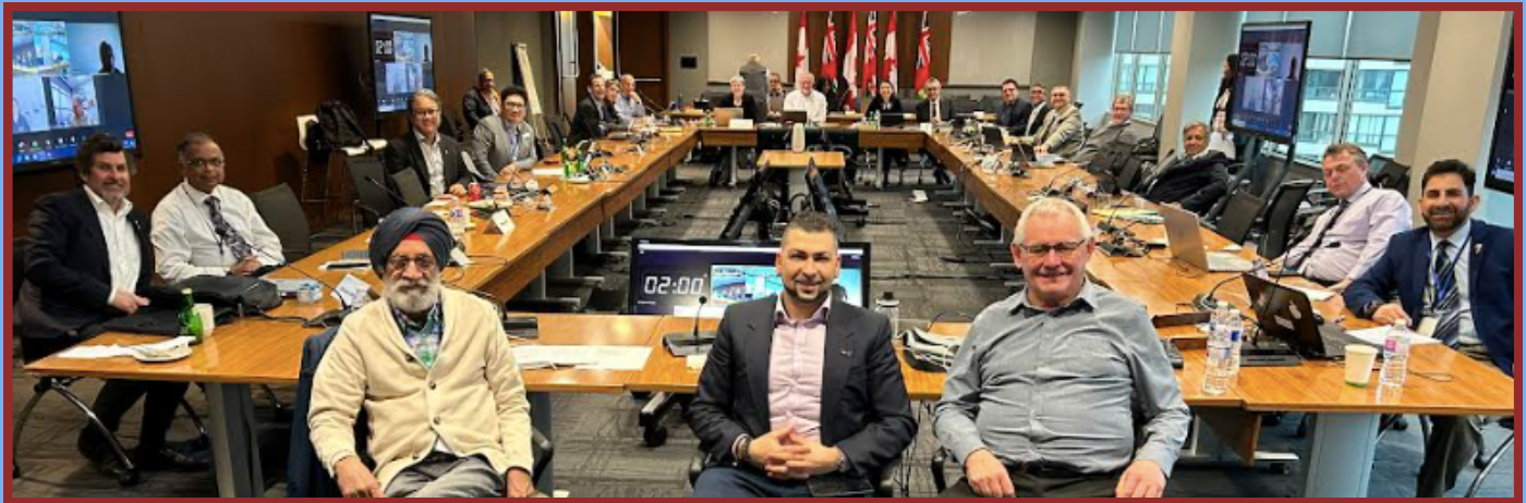
PEO Councillors pose for a photo at the 562nd Council Meeting on April 5.