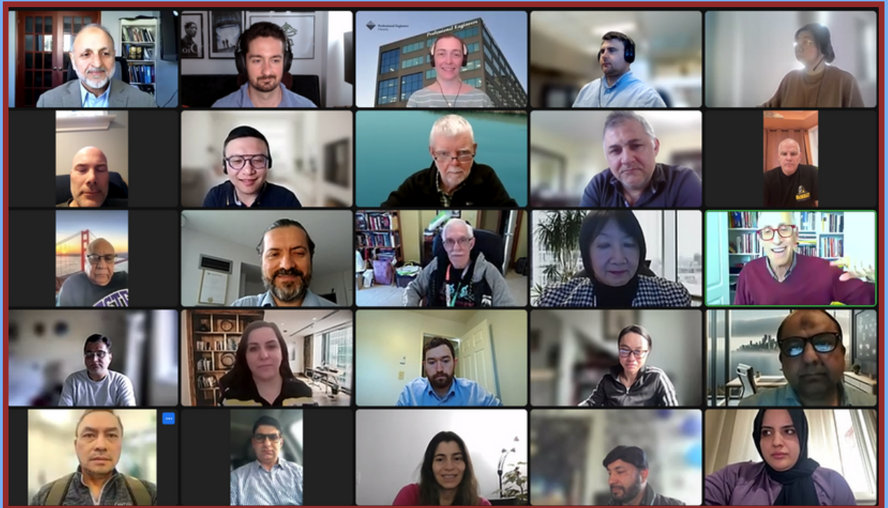
PEO GLP volunteers take part in the first Government Liaison Committee (GLC) call of 2024.