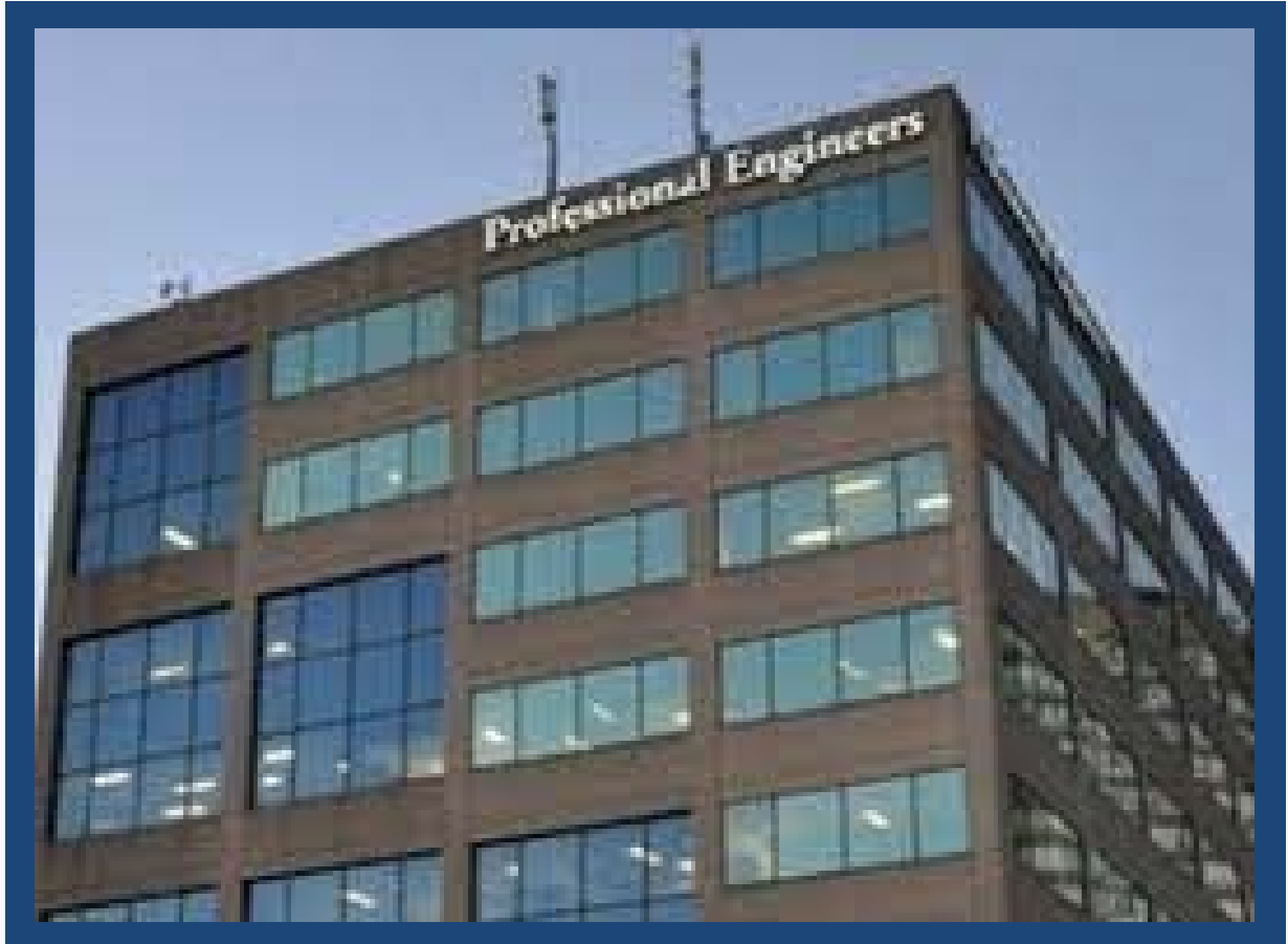
PEO Headquarters in Toronto

Through the Professional Engineers Act , PEO governs over 91,000 licence and certificate holders and regulates and advances engineering practice in Ontario to protect the public interest. Professional engineering safeguards life, health, property, economic interests, the public welfare, and the environment.