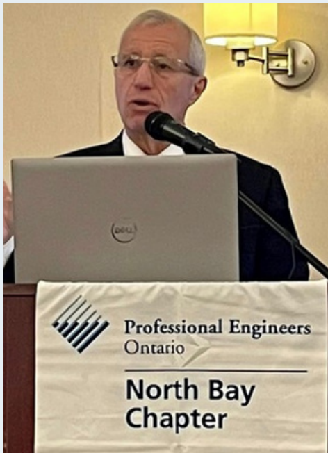
Economic Development Minister Vic Fedeli , MPP (Nipissing), spoke at North Bay Chapter's Engineer Symposium