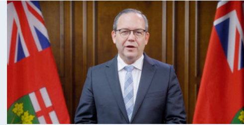
Attorney General Doug Downey, MPP (Barrie-Springwater-Oro-Medonte) spoke at PEO's 101st AGM on April 29.