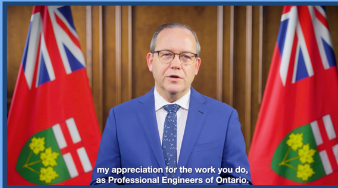
Attorney General Doug Downey , MPP (Barrie--Springwater--Oro-Medonte) addressing the PEO GLP training summit. To read the transcript of his address, see page six.