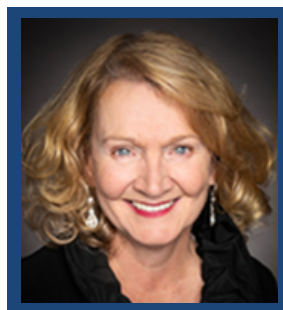
Karen McCrimmon , Former MP (Kanata—Carleton)