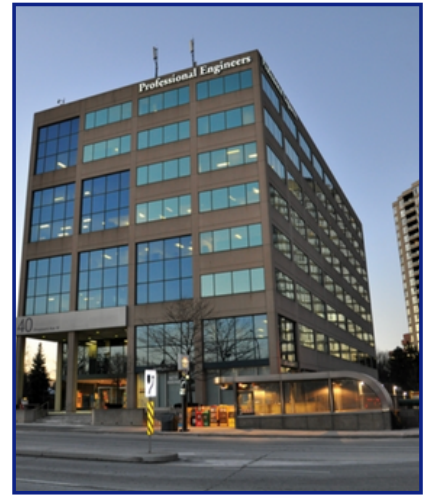
PEO Headquarters in Toronto.

This week's question: Which PEO Councillor attended a Toronto community event with MPPs such as Colleges and Universities Minister Jill Dunlop MPP (Simcoe North) on June 8?