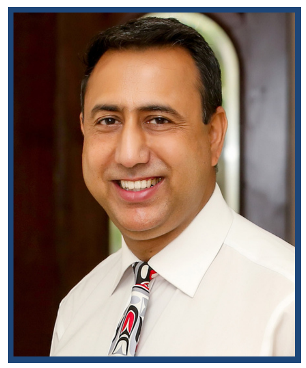
Deepak Anand, MPP

Deepak Anand , MPP was first elected to the Legislature in 2018. He currently serves as Parliamentary Assistant to the Minister of Labour, Immigration, Training and Skills Development.