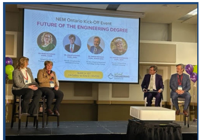
Panelists at the OSPE's NEM kick off on March 1.