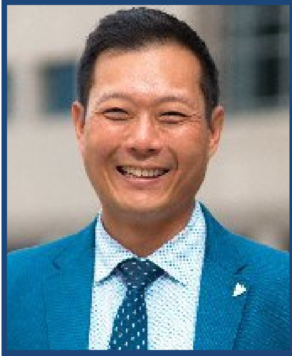
Stan Cho, MPP

Stan Cho , MPP was first elected to the Ontario Legislature in 2018 and currently serves as the province's Associate Minister of Transportation.