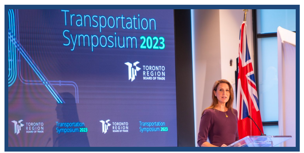
Transportation Minister Caroline Mulroney , MPP (York-Simcoe) spoke at the Toronto Region Board of Trade on February 8.

Ontario Minister of Transportation and Francophone Affairs Caroline Mulroney , MPP (York-Simcoe) was the keynote speaker at the Toronto Region Board of Trade Annual Transportation Symposium on February 8.