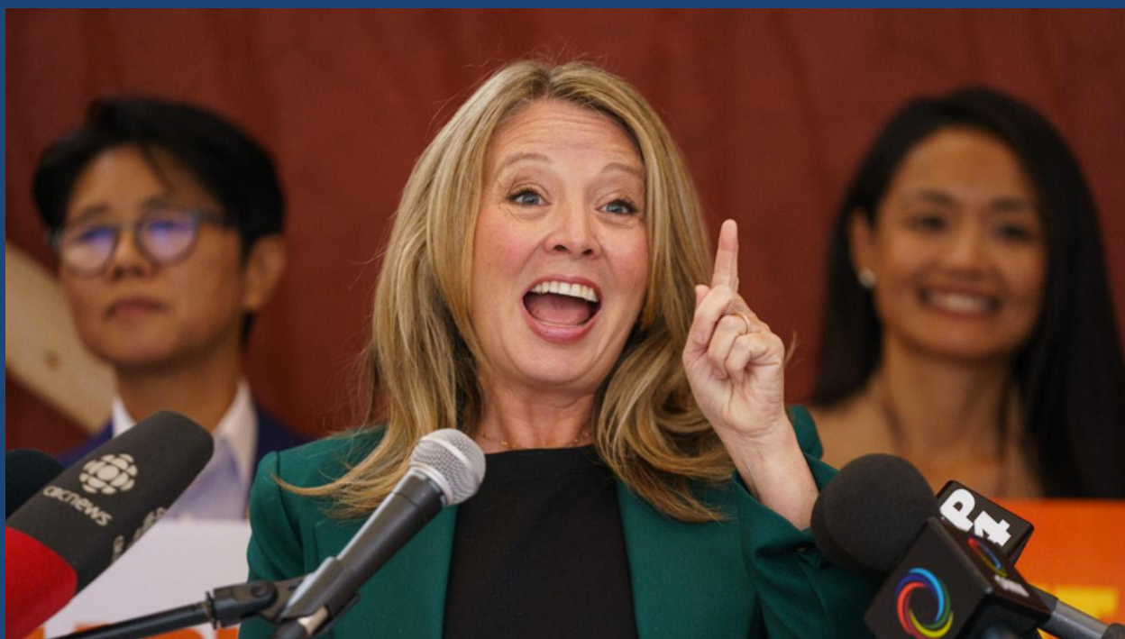
Marit Stiles , MPP (Davenport) was announced as the new leader of the Ontario New Democratic Party on December 6. This photo is from her campaign launch on September 22.