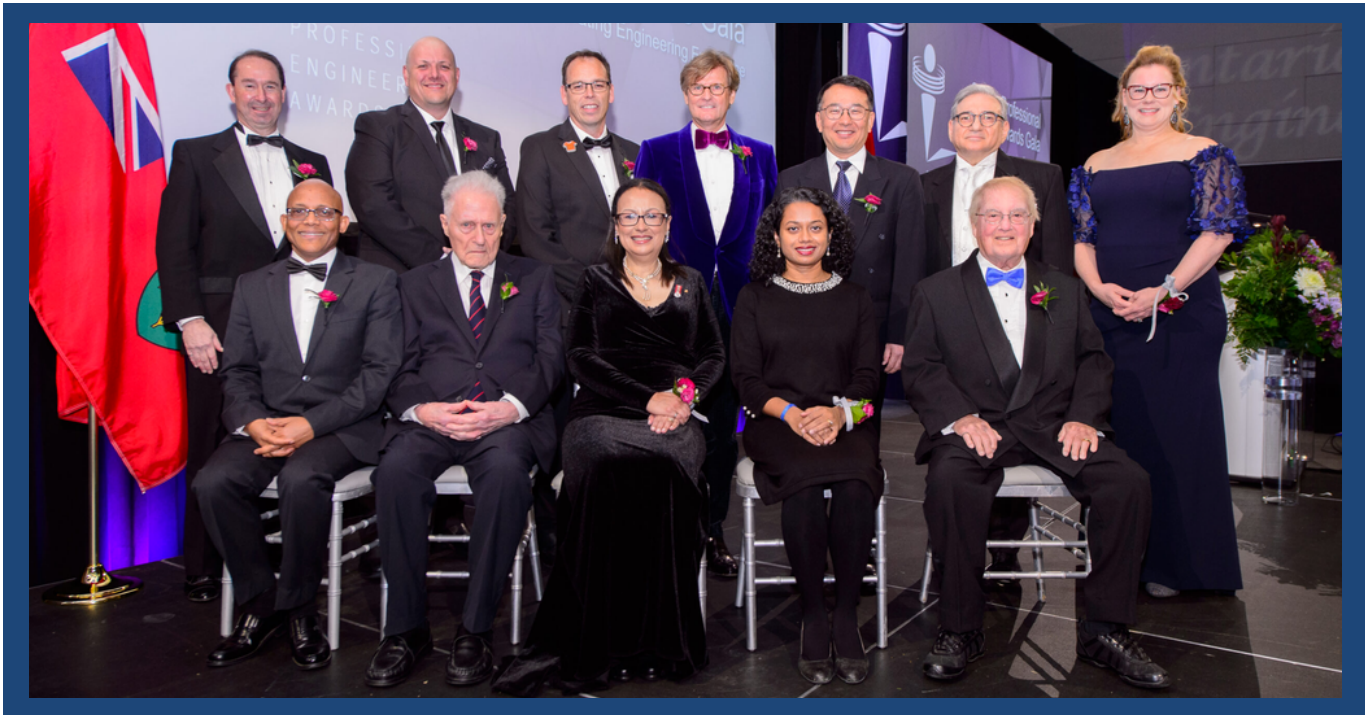
Recipients of the 2022 Ontario Professional Engineers Awards.

VAUGHAN - The Ontario Professional Engineers Award Gala was held on November 18. There were 10 award recipients: