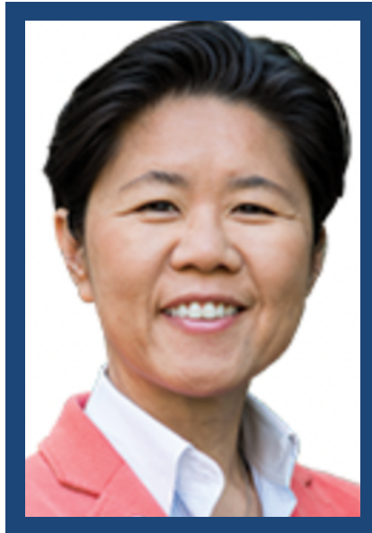
Kristyn Wong-Tam , MPP (Toronto Centre)