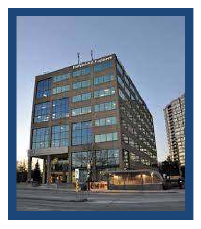
PEO headquarters in Toronto.

You may only win once in a four-week span.