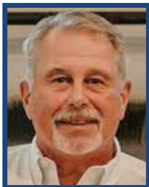
Neil Lumsden , MPP (Hamilton East- Stoney Creek)

Neil Lumsden is the newly elected MPP for the riding of Hamilton East-Stoney Creek, representing the Progressive Conservatives. MPP Lumsden is the new Minister of Minister of Tourism, Culture and Sport.