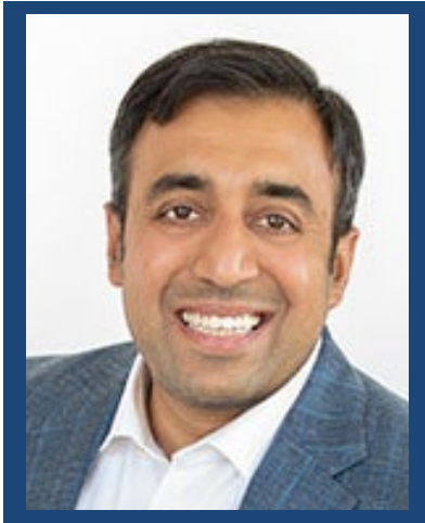
Hon. Kaleed Rasheed , MPP (Mississauga East-Cooksville)

This week, the GLP Weekly Times features Hon. Kaleed Rasheed , MPP (Mississauga East-Cooksville), Associate Minister of Digital Government and Chris Glover , MPP (Spadina-Fort York).