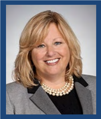
Hon. Lisa Thompson , MPP (Huron-Bruce)

Hon. Lisa Thompson , MPP (Huron-Bruce) was first elected to the Ontario Legislature in 2011.