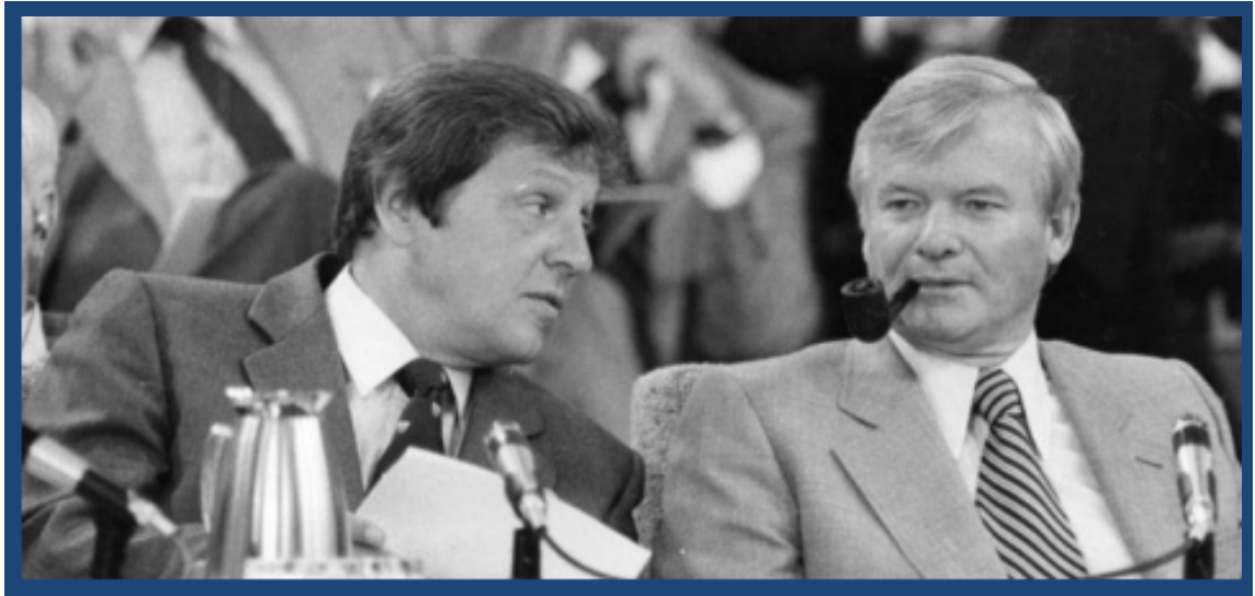
A memorial service was held for Ontario's 18th Premier William Davis (right) at Roy Thomson Hall on November 4. With him in this file photo from the 1980s is then Attorney General Roy McMurtry (left).

A memorial service for Ontario's 18th Premier William Davis was held at Roy Thomson Hall on November 4. He passed away in August.