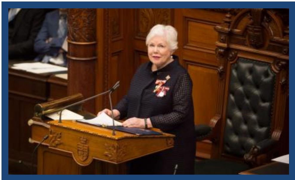
Lieutenant Governor Elizabeth Dowdeswell delivering the Speech from the Throne at Queen's Park on October 4.

Lieutenant Governor Elizabeth Dowdeswell delivered Premier Doug Ford's , MPP (Etobicoke North) throne speech on October 4. It marked the reconvening of the Legislature and introduced the government's agenda ahead of the June 2022 election.