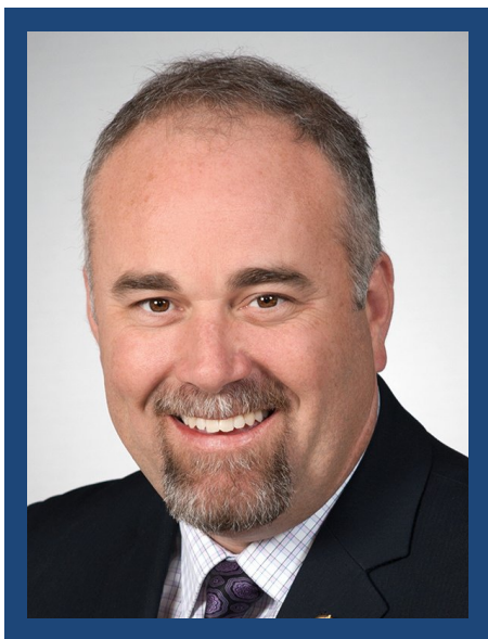
Hon. Todd Smith , MPP (Bay of Quinte), Minister of Energy

Todd Smith , MPP (Bay of Quinte) was first elected to the Ontario Legislature as a Progressive Conservative in 2011. He currently serves as the Minister of Energy.