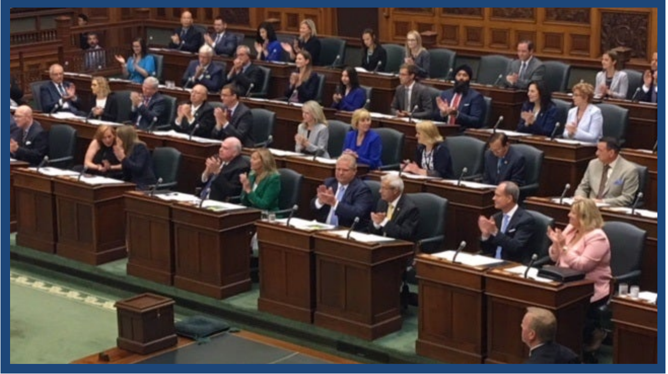
The Ontario Legislature sitting.

Following the cabinet shuffle on June 18, nine new Parliamentary Assistants and nine new Deputy Ministers were appointed by Premier Doug Ford (Etobicoke North) the week of July 5.