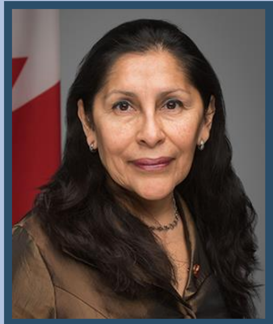
Senator Rosa Galvez , P.Eng., recently spoke to Engineers Canada about the importance of professional engineering licensing.

For a link to the full story, click here .