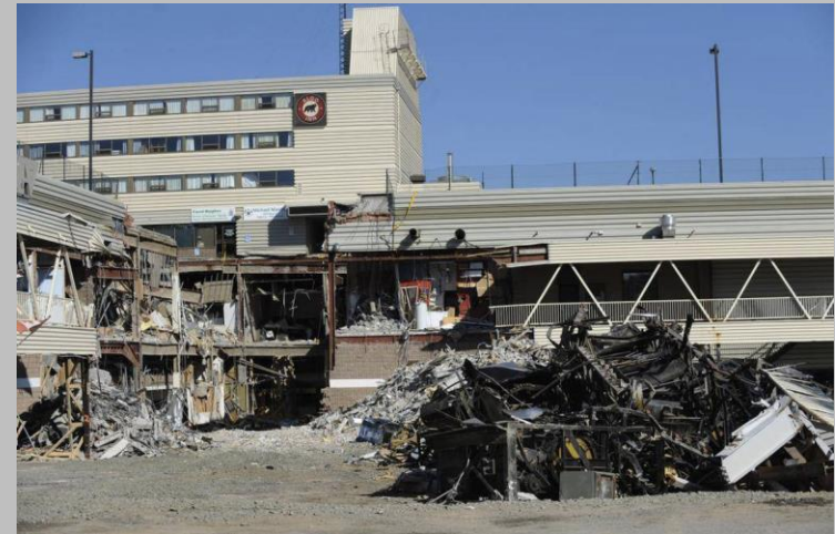
Algo Mall Collapse in Elliot Lake

PEO is modernizing and improving their regulatory role. Be aware of these initiatives and be prepared to discuss them with MPPs.