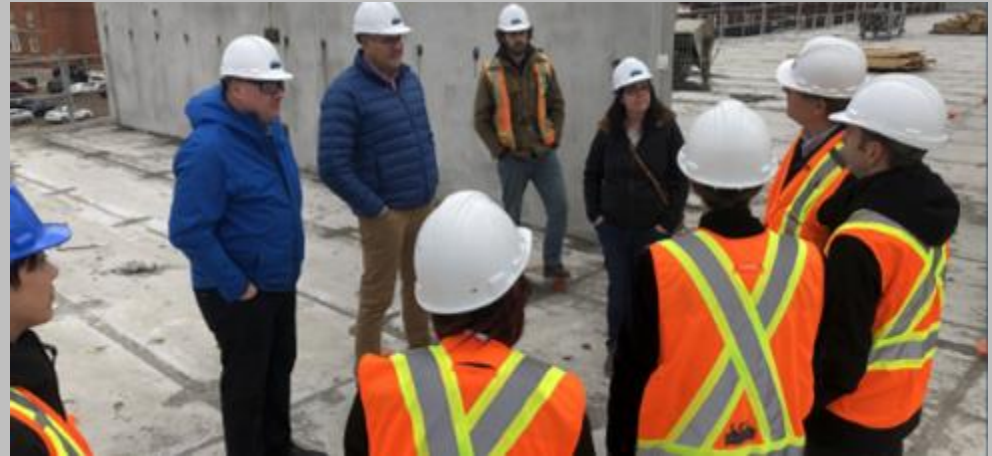
MPP Will Bouma at a PEO Brantford Chapter Take Your MPP to Work Day.