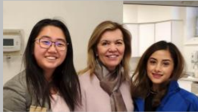
PEO GLP representatives with Minister Elliott