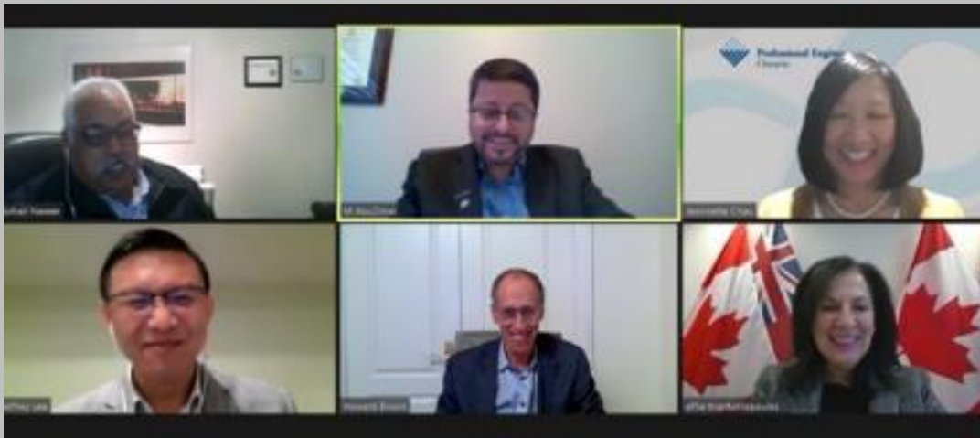
PEO Oakville Chapter held an online MPP meeting