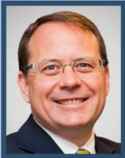
Green Party Leader Mike Schreiner, MPP (Guelph).

The PEO Government Relations Conference Committee continues to plan for the upcoming 2020 PEO Government Relations Conference. It will be held virtually on Friday, November 6.