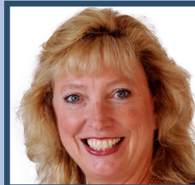
Marilyn Gladu , P.Eng., MP (Sarnia-Lambton)