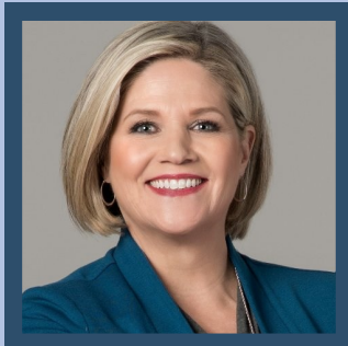
NDP Leader Andrea Horwath , MPP (Hamilton Centre)