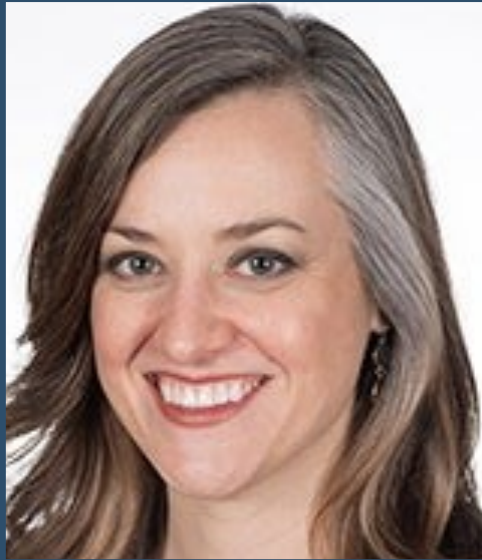
Jennifer French , MPP (Oshawa), NDP Transportation, Highways and Infrastructure Critic