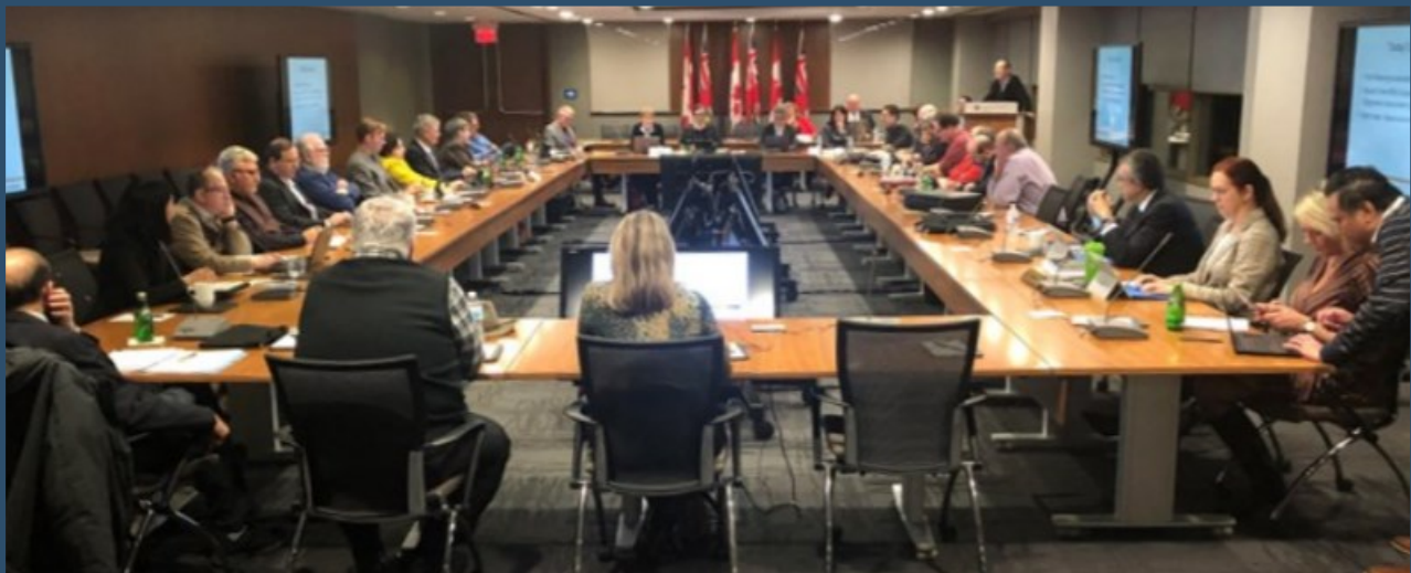
PEO Council at an in-person meeting hosted at PEO Headquarters in February 2020.

PEO Council will be hosting their 537th meeting today.