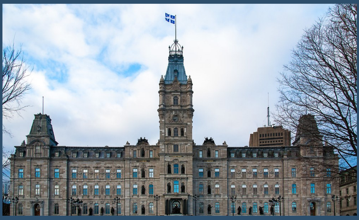
National Assembly of Quebec.

(MONTREAL) - An Act to amend the Professional Code (Bill 29) was passed on September 24 in the National Assembly of Quebec.