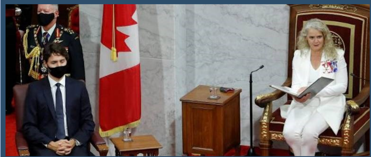
Governor-General Julie Payette , ing. (right) delivered the Federal government's Speech from the Throne on September 23. With her in the photo is Prime Minister Justin Trudeau (left).

(OTTAWA) - Governor-General Julie Payette , ing., delivered the Government of Canada's Speech from the Throne on September 23.