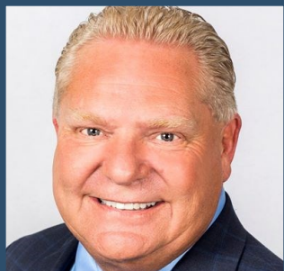
Premier Doug Ford , MPP (Etobicoke Centre)