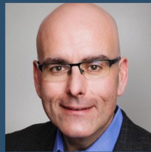
Liberal Leader Steven Del Duca