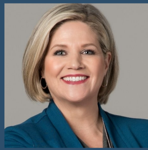
NDP Leader Andrea Horwath , MPP (Hamilton Centre)