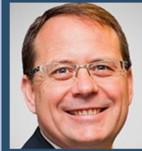
Green Party Leader Mike Schreiner , MPP (Guelph)

The PEO Government Relations Conference Committee continues to plan for the upcoming 2020 PEO Government Relations Conference. It will be held virtually on Friday, November 6 from 10 AM to 3 PM.