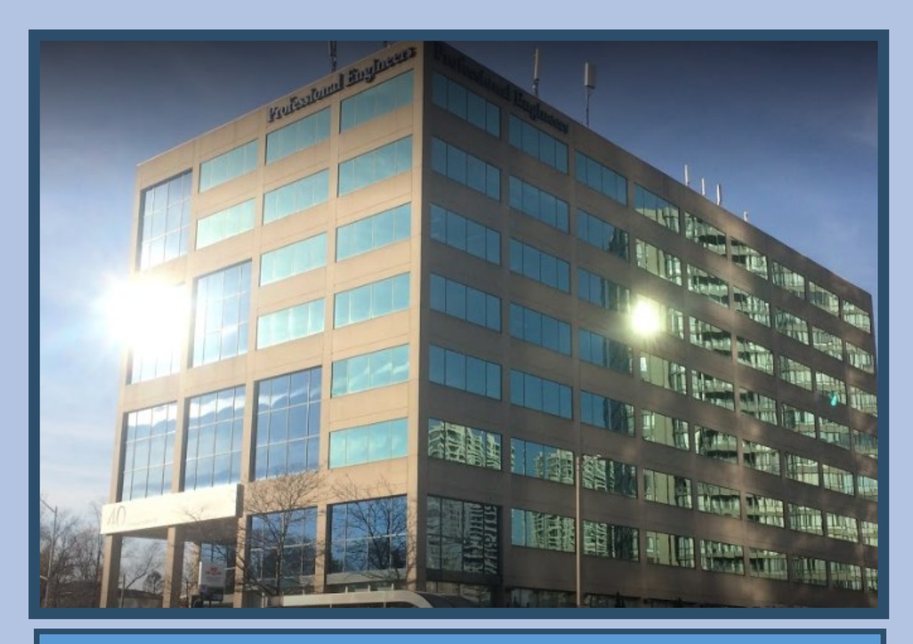
PEO Headquarters in Toronto.

PEO is now accepting P.Eng. applications via email.