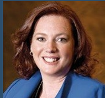
Hon. Lisa MacLeod , MPP (Nepean), Minister of Heritage, Sport, Tourism and Culture Industries

(OTTAWA) - Lisa MacLeod , MPP (Nepean), Ontario's Minister of Heritage, Sport, Tourism and Culture Industries held a telephone town hall on July 13 to discuss the government's response to COVID-19.