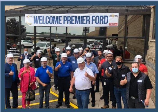
Premier Doug Ford , MPP (Etobicoke North) visited Sun-Brite canning facility in Leamington on July 16.

(CAMBRIDGE) - Premier Doug Ford , MPP (Etobicoke North) announced on July 20 that seven new municipalities will now move to Stage 3 in the province's reopening plan. They are Durham, Halton, Haldimand-Norfolk, Hamilton, Lambton, Niagara, and York. Three municipalities that will remain subject to Stage 2 are Toronto, Peel, and Windsor-Essex.