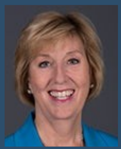
Laurie Scott , MPP (Haliburton-Kawartha Lakes-Brock), Minister of Infrastructure

Ontario's Minister of Infrastructure, the Green Party Leader and an NDP MPP hosted online events last week.