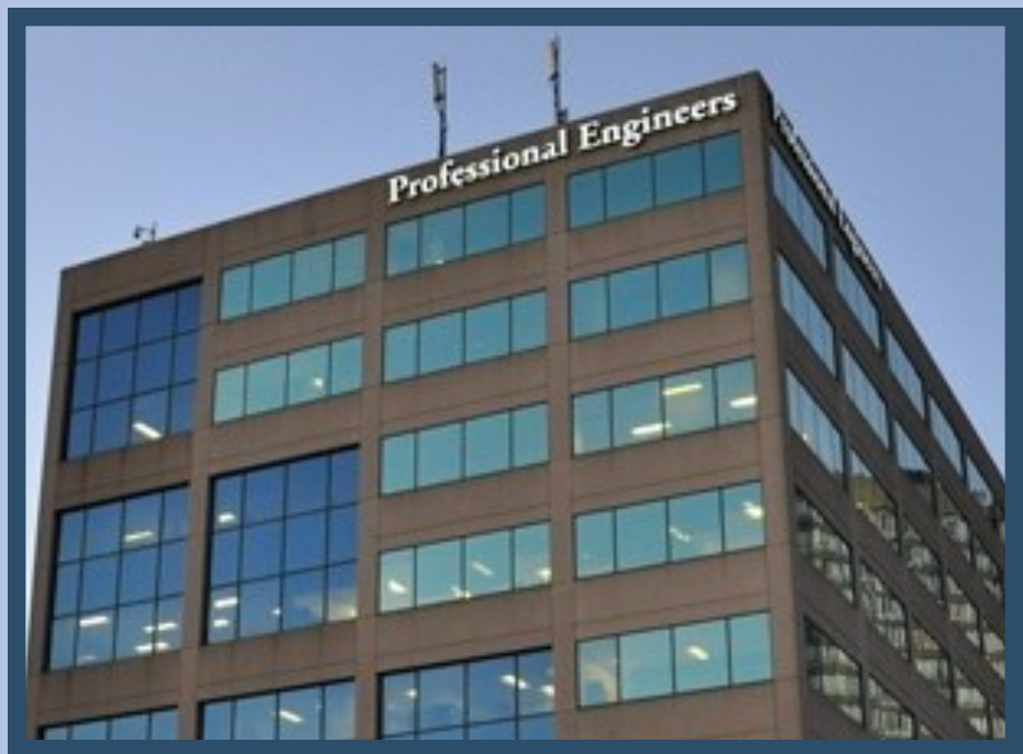
PEO Headquarters in Toronto.

The Council meeting also covered the steps PEO is taking to adapt to a remote environment, including processing P.Eng. applications, issuing new licenses and seals, taking the National Professional Practice Examination, handling complaints investigations, publishing Engineering Dimensions , conducting committee and Chapter meetings, and more.