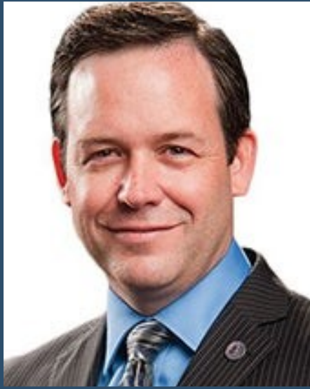
Attorney General Doug Downey , MPP (Barrie-Springwater-Oro Medonte).

The Attorney General and two MPPs hosted three individual town halls last week.