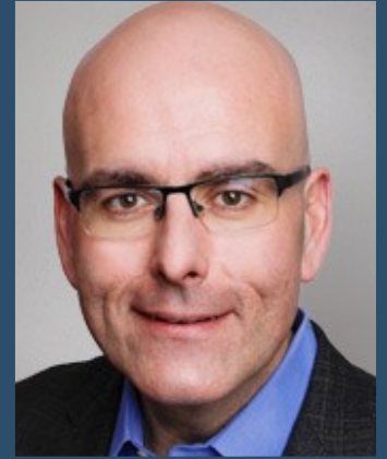
Steven Del Duca , Ontario Liberal Party Leader.

Elected officials have been hosting online townhalls as a way to stay connected with their constituents during a time of ‘physical distancing’, due to COVID - 19.