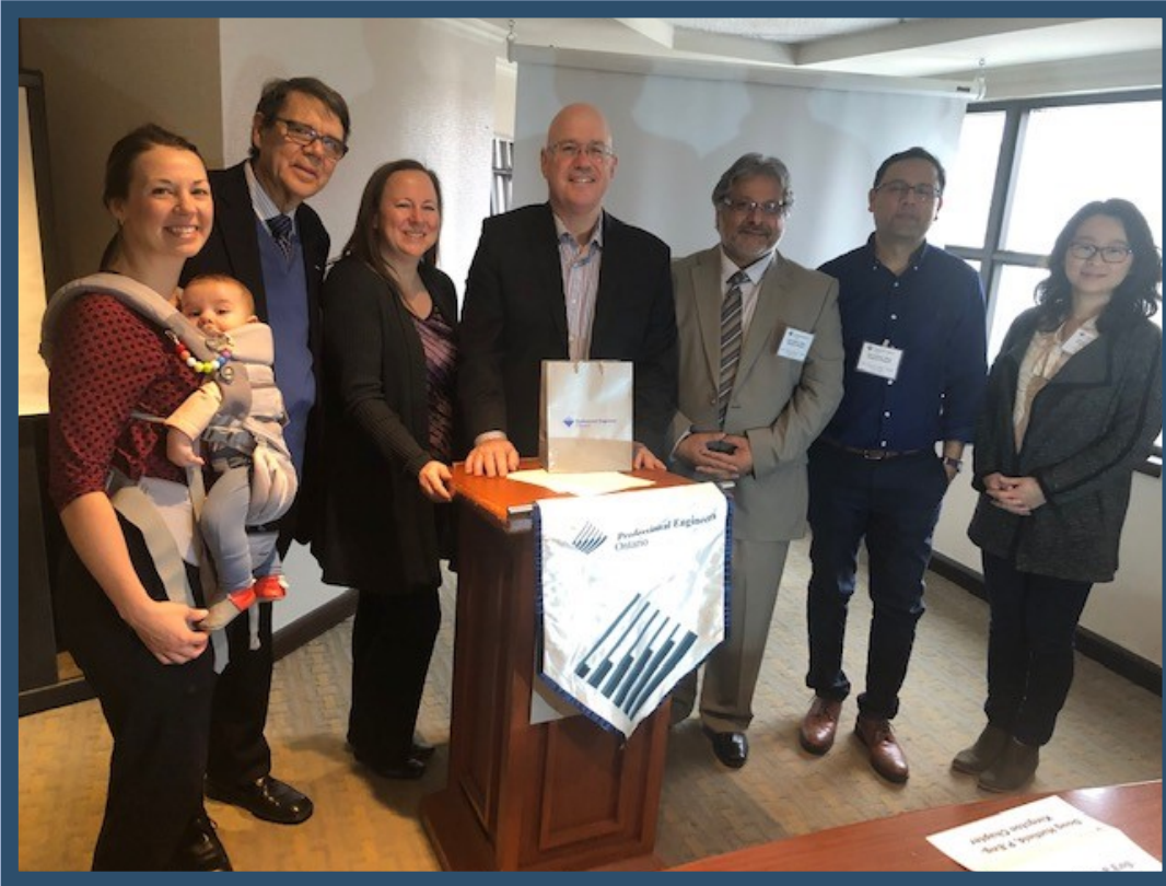
Minister of Municipal Affairs and Housing Steve Clark , MPP (Leeds—Grenville—Thousand Islands and Rideau Lakes) (centre) was a guest speaker at the PEO Eastern Region GLP Academy on November 23.

(KINGSTON) - Three MPPs shared their experiences on November 23 in Kingston with PEO representatives from chapters across Eastern Ontario on how to build better relationships with government. Speaking at the 2019 PEO Eastern Region GLP Academy were: