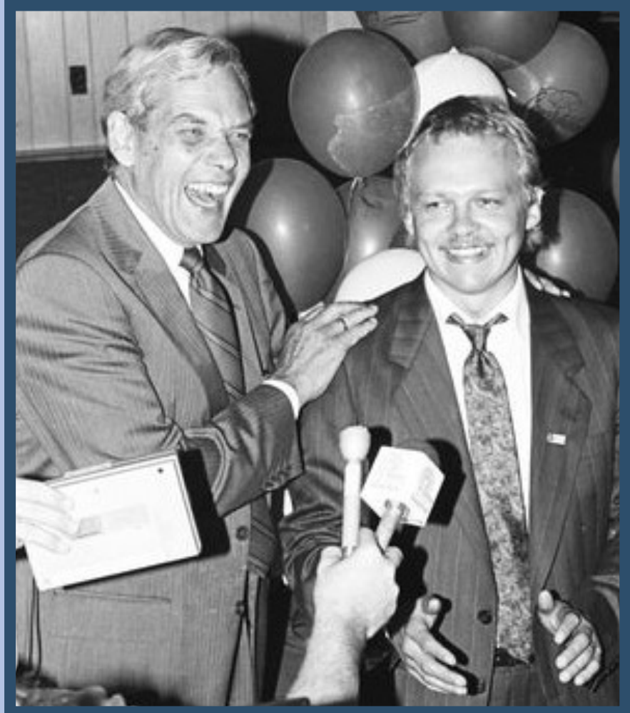
Former Speaker of the Legislative Assembly of Ontario Hugh Edighoffer (left) passed away on July 2 in Mitchell, Ontario at the age of 90. He was remembered by colleagues including former Ontario Premier David Peterson and former Ontario Liberal Party Leader, Finance Minister, and Deputy Premier Robert Nixon .